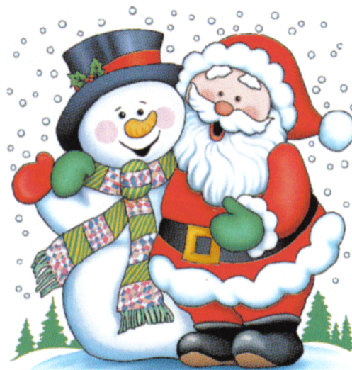
Christmas joy warms the heart